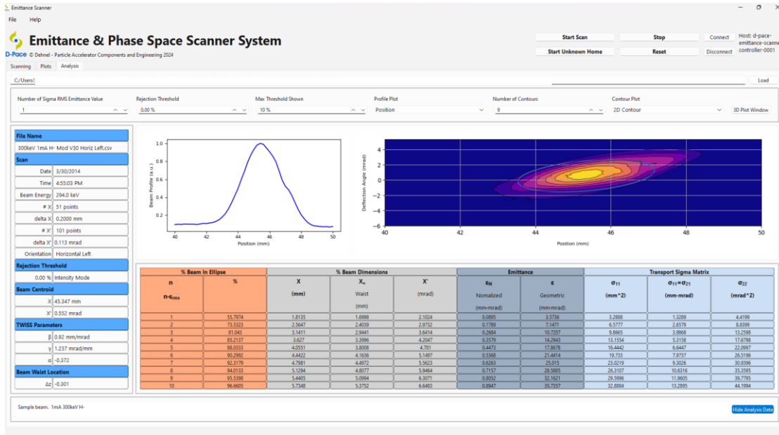
Screenshot of the analysis software presenting results from a scan of a 1 mA, 300 keV H- beam.